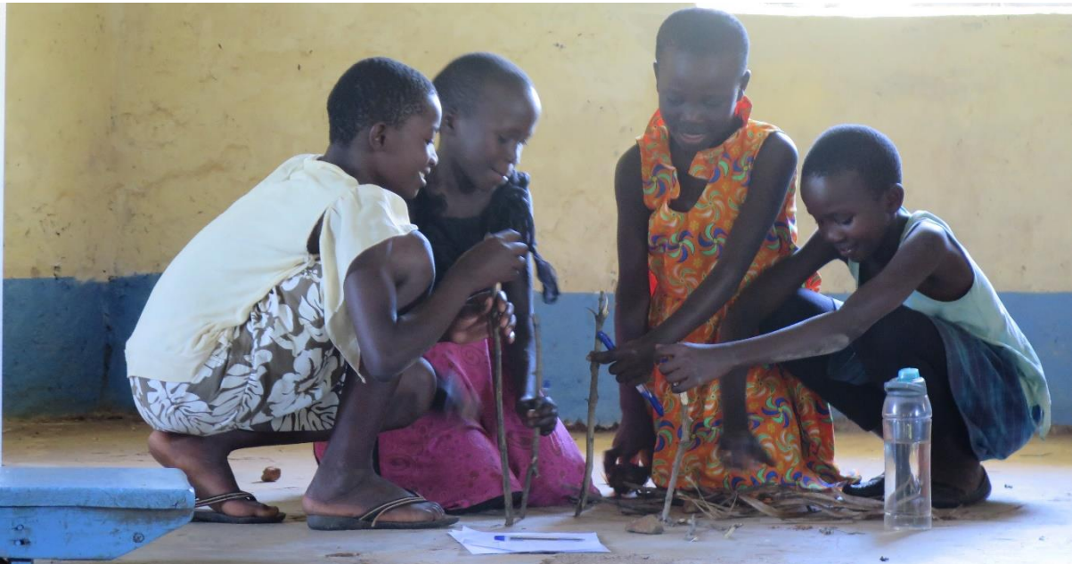
These girls wanted to become architects and chose a project during the workshop with widows' children to design and construct a house

In the second workshop led by four youth leaders who also grew up as widows' children, the youths shared their personal stories of overcoming adversity. They challenged the 23 widows' children to have a personal vision for their future, and to be determined, focussed, persistent and patient in achieving that vision. Their stories highlighted the need for courage and taking initiative over self-pity, perseverance over losing hope, and forgiveness over bitterness, to overcome life's challenges. In small groups, the widows' children created and presented short dramas that demonstrated the various challenges they face: lack of school fees, managing boy-girl relationships, dealing with peer-pressure, and balancing household responsibility with schoolwork. We hope to create more of these opportunities and to use storytelling and drama as a pathway to finding solutions to the challenges the youths face.