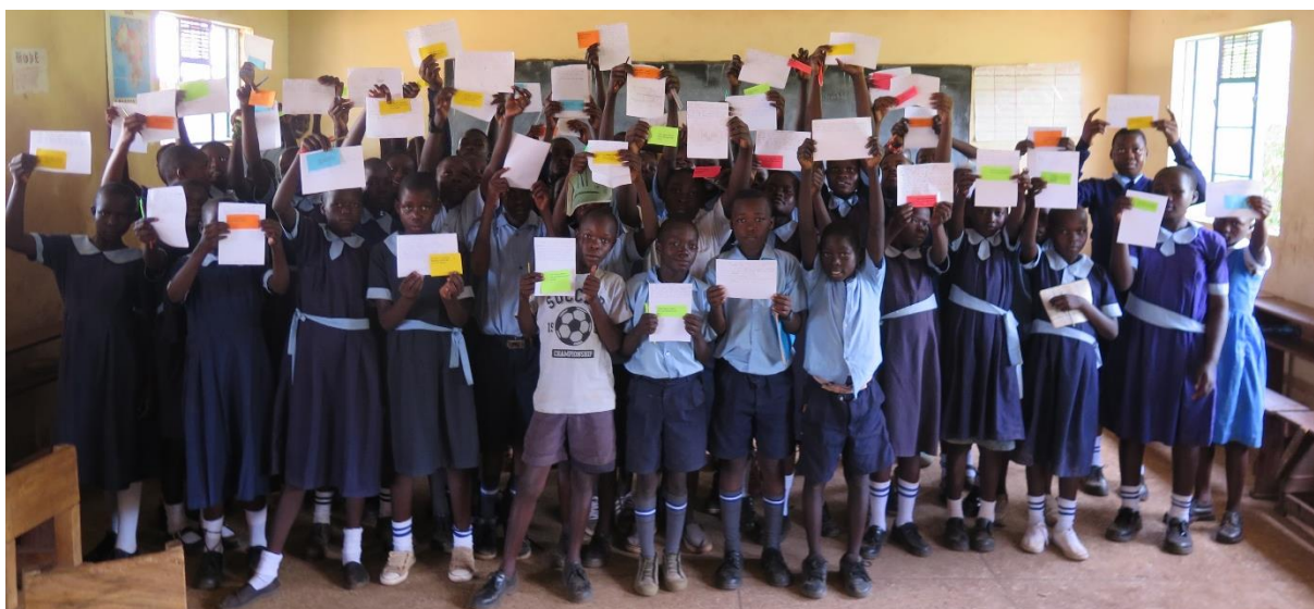
Mbotu school kids with their stories during youth mentorship workshop

We held two workshops with youths. The first workshop with 50 children targeted 6 th and 7 th graders at Mbotu Sunrise Primary School. Through games and storytelling activities, the youths wrote and read aloud their stories, sharing dreams for themselves and their families and describing hopes of becoming teachers, engineers, pilots, and doctors. Students also shared what they were grateful for, including their families, the opportunity to go to school, and provision of food and clothing. This workshop aimed at building confidence in speaking in public as well as nurturing creativity in storytelling.