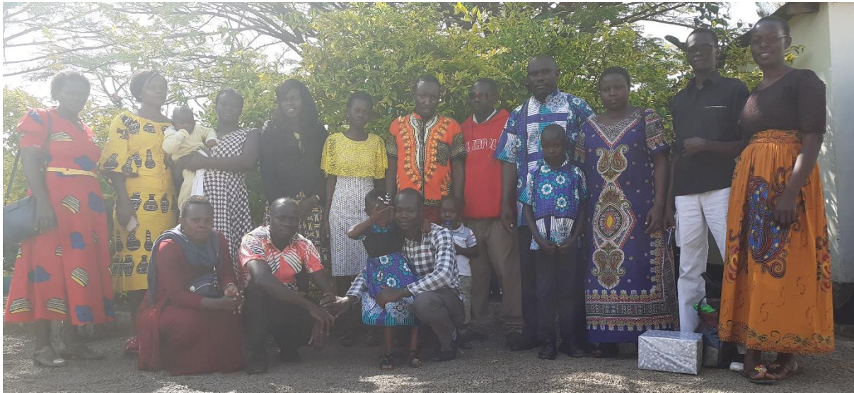
Nyanam local team with their families and all the youth leaders and volunteers

We concluded the year with our annual team building meeting where we thank all of our volunteers for their efforts throughout the year and planned for engagement for 2020