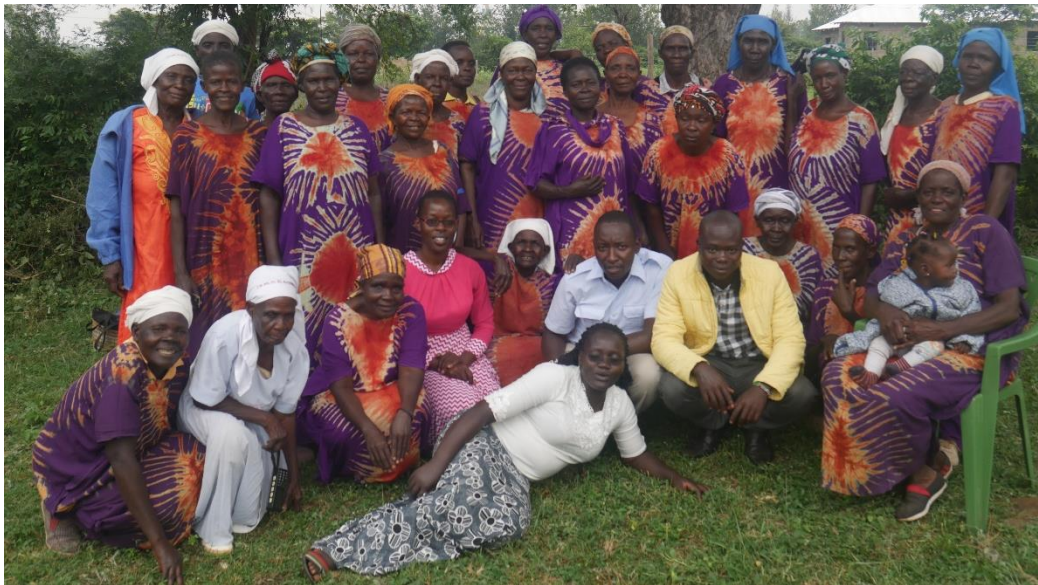
Chi Ruoth ma Jahera Leadership Circle

In 2019, we implemented monthly group counselling session in each leadership circle, totalling to 45 group counselling sessions. We also offered individual counselling; however, these were based on need and we plan structure this better as we recruit counsellors in our program.