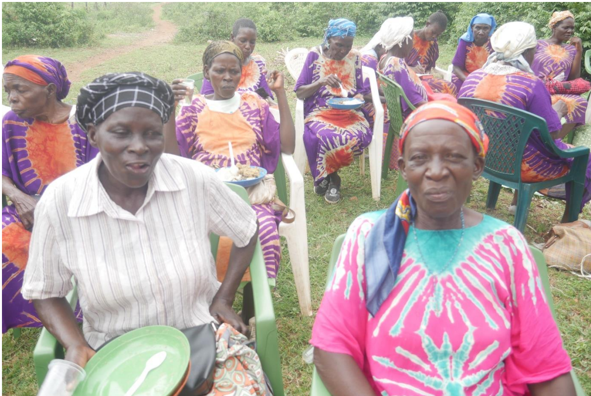
Widows sharing a meal on International Widows Day 2019

The widows shared personal stories of renewed hope, confidence and a sense of purpose in the widows' lives, presented songs from their widows' choir and showcased their micro-enterprise in an open market where they made sales too: vegetables, fruits, seeds, firewood, second hand clothes, sewed and crocheted table cloths, and animal ropes made from sisal. Nyanam gave the widows a gift of a kilogram of sugar each and expounded on the widows' invitation to lead. We also prayed for health, strength, unity and for success in our journey to the banquet table. A community of friends from Ontario, Canada, also joined in the celebration of International Widows Day, by signing a card for the widows. All in all, the widows experienced the love and support intended for the International Widows Day. They experienced the joy of being part of a local and a global community that cares.