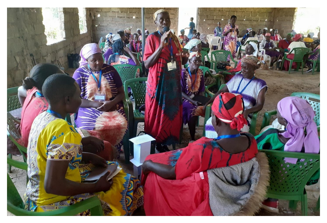
Figure 9. Widows during micro-enterprise training

Before the COVID pandemic limited our gatherings, we had a wonderful opportunity to train 94 widows in micro-enterprise training funded by Women In the Window International (WiW). For the first time, this training was led by six widows who had been trained in 2019 in the same course. During the training, the women studied Biblical women in business, mapped their talents and market opportunities in their communities and developed business plans for varied products/services they wanted to offer. They studied the four legs of marketing (product, price, promotion and place), and the need to invest in every leg to ensure the sustainability of their businesses. They learned how to set the price for their products, accounting for all the production costs and profits, and to keep proper records for their businesses.