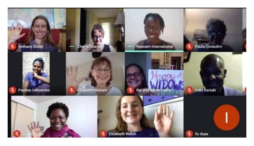
Figure 6. Some of the participants in our 2020 virtual celebrations of International Widows Day

On June 23<sup>rd</sup>, the Nyanam team gathered with a small group of widows from Kisumu County while following social distancing protocols. As a part of the celebration, Nyanam distributed our second COVID relief kits to the widows to a total of 115 households. The kit included a one-month food supply with 20 kgs of maize, 4 kgs of beans, 4 kgs of sugar and 2 liters of oil. This addressed the eminent hunger that many of the widows were facing during this crisis. As children schools closed and children stayed home, the need for food increased yet the means of provision reduced. During this moment, many widows shared of how the food relief had been timely. Some had come to this event having slept the night before on empty stomachs as they lacked any source of food. We thank everyone who joined us in fundraising for this food relief kit.