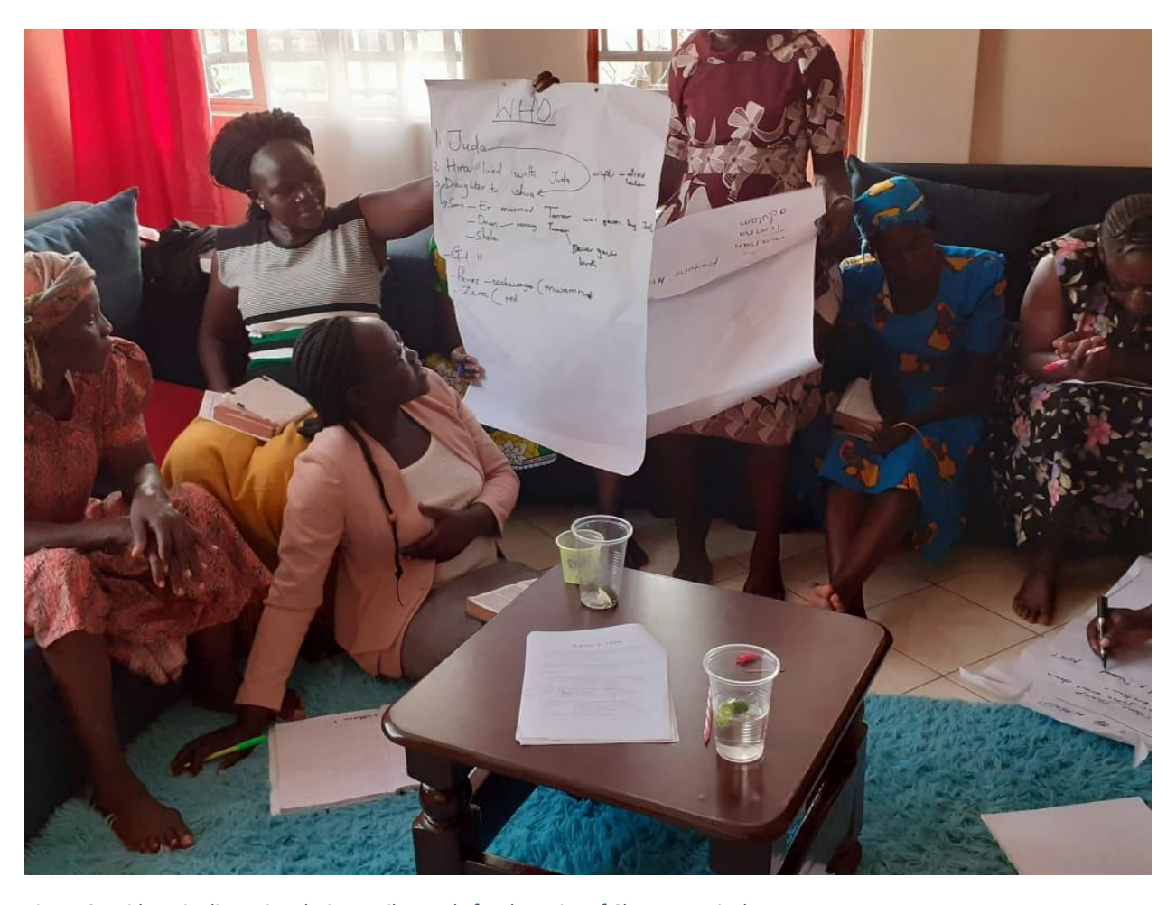
Figure 3. Widows in discussion during a pilot study for the Voice of Change curriculum

In 2020, we piloted the first study of the Voice of Change curriculum in a 2-day training in which we explored the concept of home for widows. Beginning with a thought provocative question, "Where is a widow's home upon a husband's death," the widows discussed the "home options" they have, the advantages and disadvantages they face with each home option they choose, what influences their decisions for home, how their homes are viewed and treated in the community and what can be done to improve their home situations.