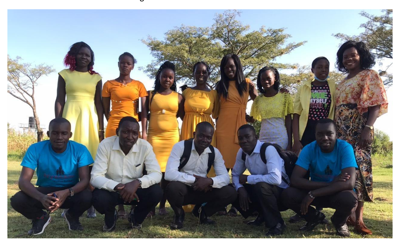
Figure 20. Youth Advisory Council members with Nyanam team

health that the youths face. Their personal experiences have led to commitment towards supporting other children of widows and sharing their stories with one another.