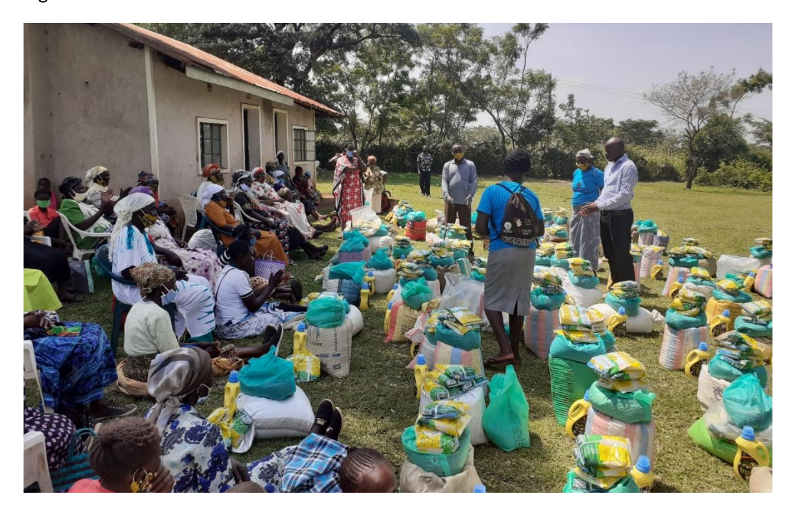
Figure 7. Covid relief food kits distributed to 115 widows during International Widows Day 2020. Each widow received 20kgs of maize, 4kgs of beans, 4kgs of sugar, 2 liters of oil

On June 23<sup>rd</sup>, the Nyanam team gathered with a small group of widows from Kisumu County while following social distancing protocols. As a part of the celebration, Nyanam distributed our second COVID relief kits to the widows to a total of 115 households. The kit included a one-month food supply with 20 kgs of maize, 4 kgs of beans, 4 kgs of sugar and 2 liters of oil. This addressed the eminent hunger that many of the widows were facing during this crisis. As children schools closed and children stayed home, the need for food increased yet the means of provision reduced. During this moment, many widows shared of how the food relief had been timely. Some had come to this event having slept the night before on empty stomachs as they lacked any source of food. We thank everyone who joined us in fundraising for this food relief kit.