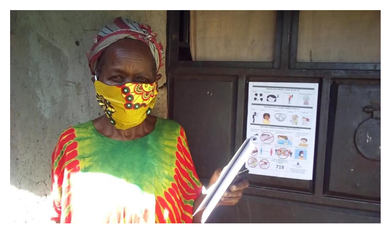
Figure 16. A widow showing her COVID-19 education leaflet on her doorpost

We also provided both widows and their children with facemasks, distributing 115 facemasks for the widows and at least two more facemasks for her children. One of the widows at Nyanam who a seamstress, made all the facemasks, through which we created an employment opportunity for her. We made reusable face masks following guidelines for home-made facemasks that were published by the Center for Disease Prevention in the USA. We shipped 100 facemasks to our partner in the USA, Women in the Window International, to help raise more funds for our COVID-19 relief initiatives.