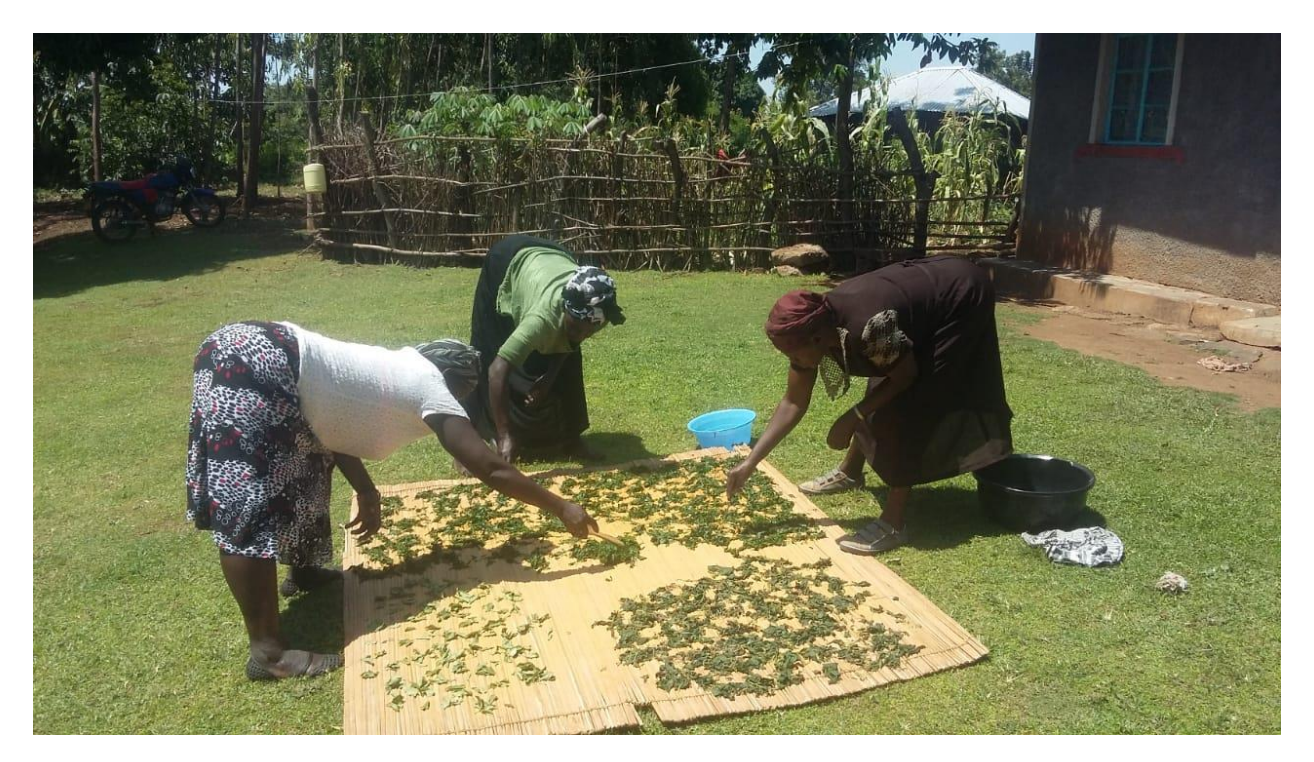
Figure 13. Widows sun drying their vegetables to preserve after harvesting.