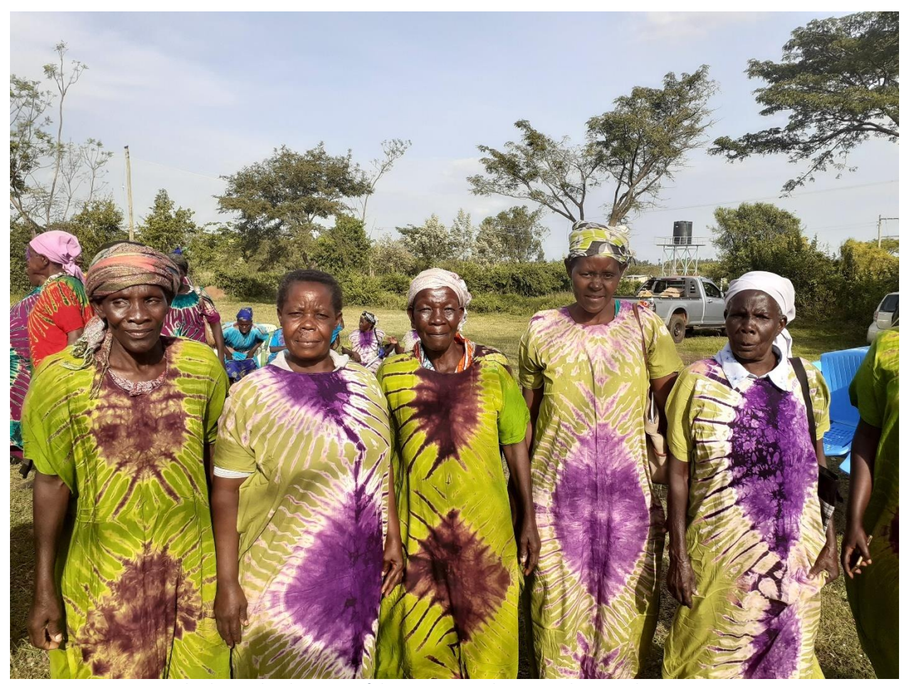
Figure 2. Karwamati Leadership Circle. This is one of the new 15-member group that joined Nyanam in 2020

leadership circles into Nyanam, one from Siaya County and eight from Kisumu County. These nine leadership circles have membership totaling to 233 widows, each circle having between 15 to 40 widows. This brought the total number of widows at Nyanam from 115 to 358 widows. Nyanam's family of widows is still expanding based on need and requests we receive from widows to include them in our work. We have prioritized a once-a-year recruitment in the last quarter of the year. In these leadership circles, widows use their connectedness and cumulative experiences to influence each other in leading self and household well. They also use their unified voice in the circles to advocate for change in their communities.